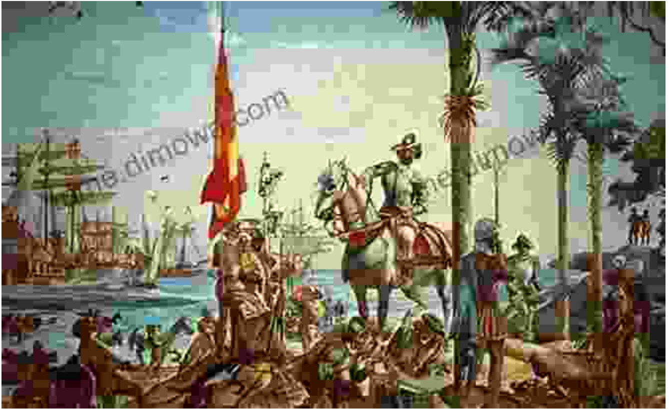
Spanish explorers arrived in Florida in 1513.