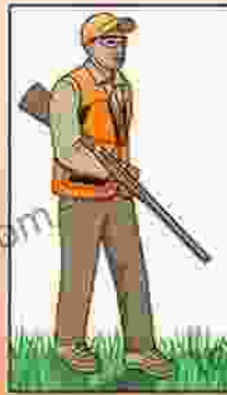
Elbow or Side Carry