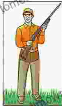
Two-handed or Ready Carry