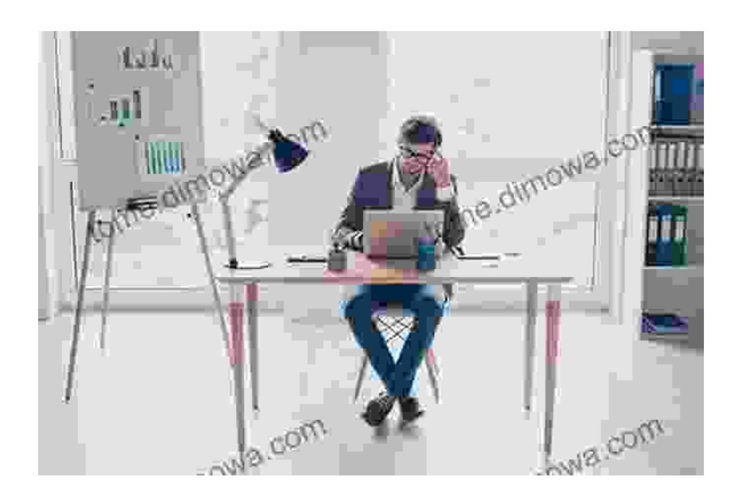
Exploring a World of Career Possibilities

Career Directions begins by guiding you through a journey of self-exploration. You'll delve into your values, interests, skills, and personality traits to gain a deep understanding of what truly drives you in a career. Through interactive exercises and thought-provoking questions, you'll uncover your hidden talents, passions, and aspirations.