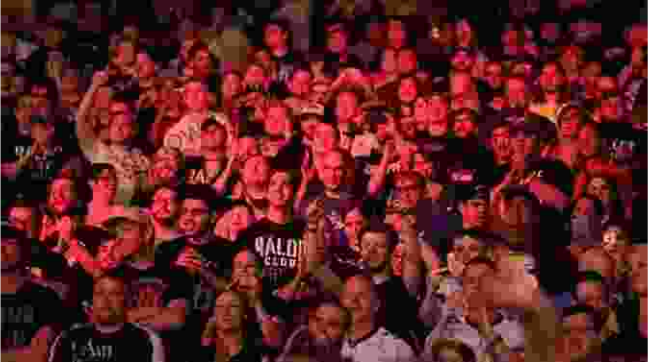
Photo shows a crowd of fans cheering at a WWE event.