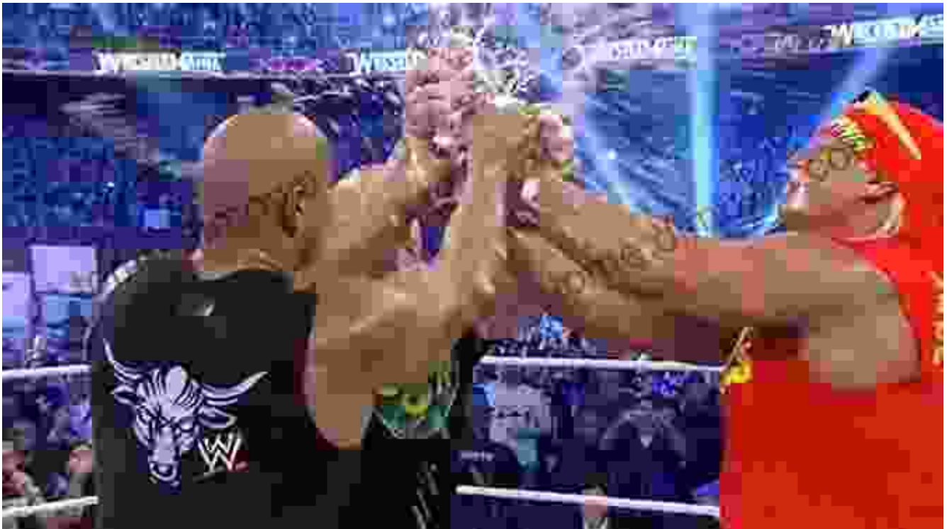
Photo shows Hulk Hogan, The Rock, and Stone Cold Steve Austin standing in the wrestling ring, facing off.

Steve Austin, witness the rise of Shawn Michaels and Bret Hart, and shudder at the ominous presence of The Undertaker.